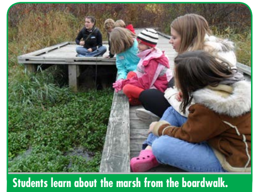
Students learn about the marsh from the boardwalk.