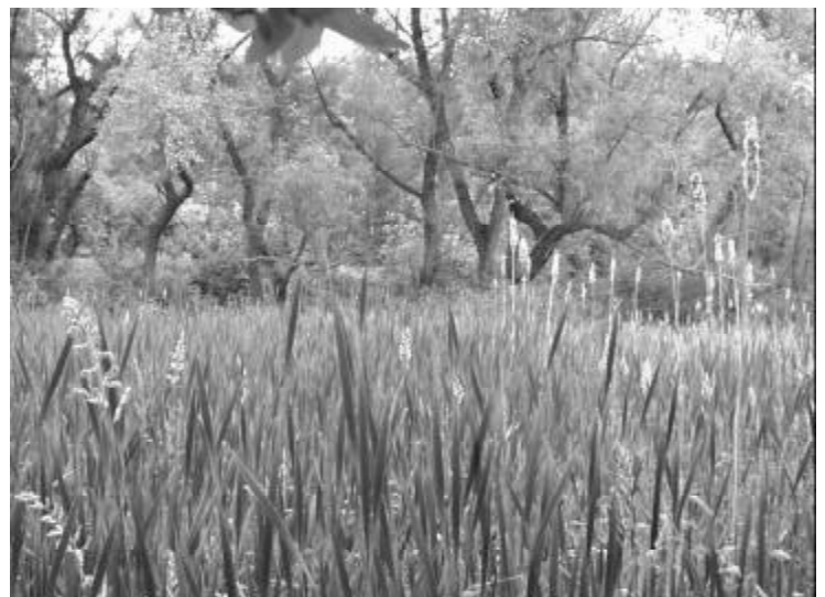
View overlooking the wetland sedges of Millbrook Marsh on Hilton Garden Inn property, now protected by ClearWater Conservancy with a conservation easement.