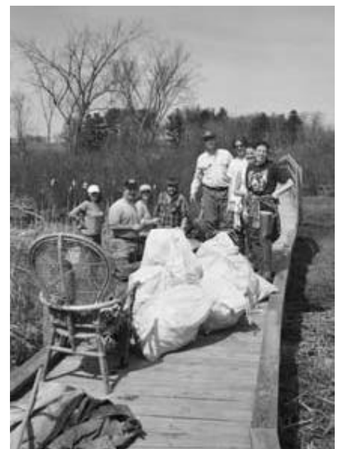
The 2004 Millbrook Marsh cleanup crew on the Boardwalk with their "haul".