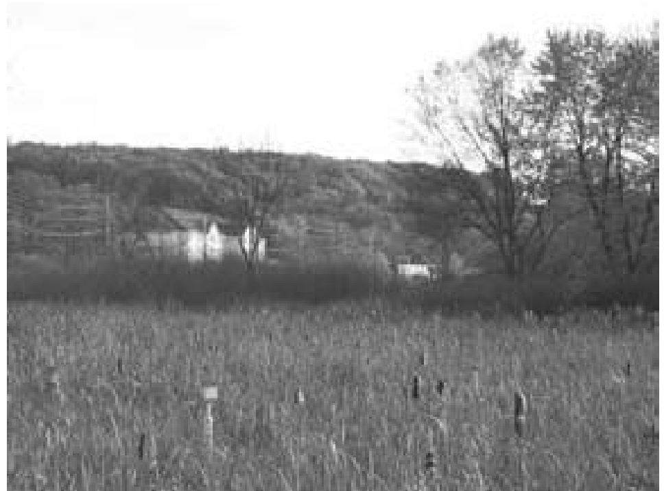
Hilton Garden Inn as seen from the Millbrook Marsh Nature Center boardwalk and bird blind. The ClearWater-owned Millbrook Marsh fen is in the foreground and Thompson Woods Preserve is in the background.

For instance, the hotel’s landscape architect consulted with ClearWater to choose plants that would be compatible with the marsh ecosystem.