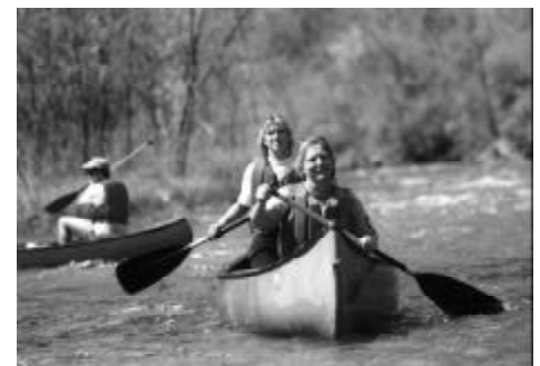
Checking out columbine on the Wildflower Walk... Planting trees at Blue Spring Park... Paddling down Spring Creek with friends