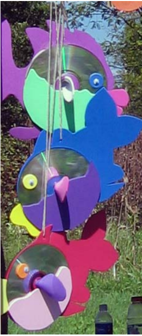
Kid's Crafts and Water Rockets at the Spring Creek Day Family Festival at Millbrook Marsh Nature Center.