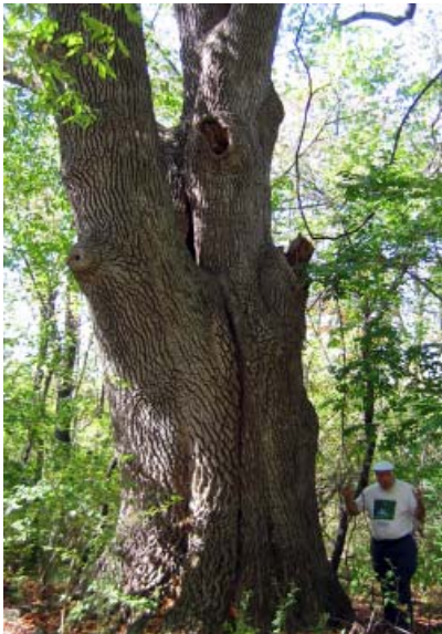
Ralph Mumma, from the Mount Nittany Conservancy, shows a tree near the Mount Nittany trailhead that pre-dates the clearcutting of the mountain for charcoal.