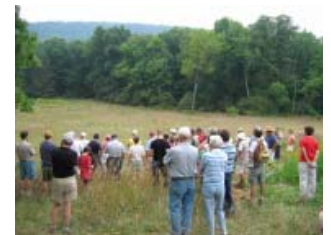
Guests at the Musser Gap Celebration tour the newest addition to Rothrock State Forest.